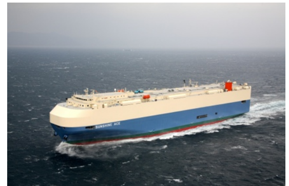
Car-carrier Sunshine Ace at sea

MOL has been transporting Mobile Library buses over years from Japan to Durban at very special freight charges since the beginning of the project.