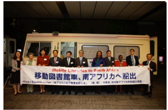
Tokyo - departure ceremony

The South African embassy in Tokyo and SAPESI Japan organized a departure ceremony on May 22 2014 in the embassy. This was, at the same time, in commemoration of 20 years of democracy in South Africa. The ceremony was a great success with the presence of various VIP guests and representation by Japanese newspapers.